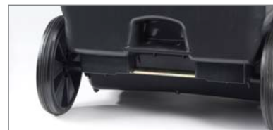
Recessed Step at the rear